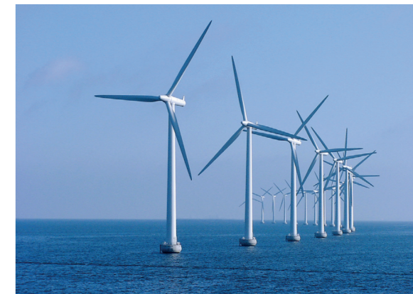
Offshore wind power plant.

The Deutsche Bundesstiftung Umwelt (Federal Environmental Foundation of Germany) is organising this event to promote innovative applications of superconductivity in the field of renewables.