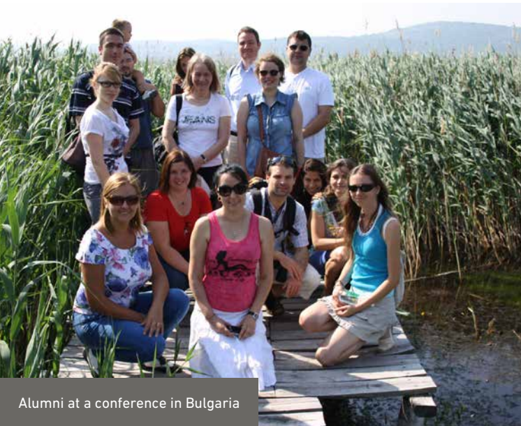
Alumni at a conference in Bulgaria

No work permit is needed for the fellowship stay in Germany. For the right of entry into Germany, however, some states require a visa. Fellowship recipients must apply for visa themselves in their native countries.