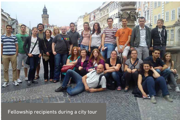
Fellowship recipients during a city tour