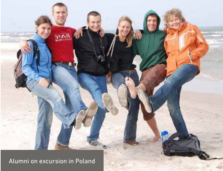
Alumni on excursion in Poland