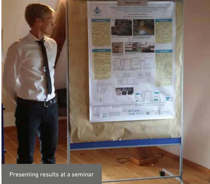
Presenting results at a seminar